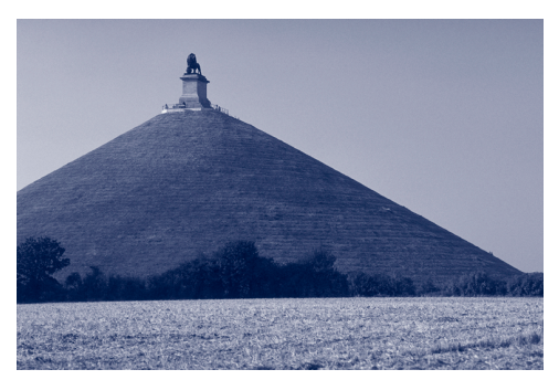
"Butte du Lion", Waterloo.