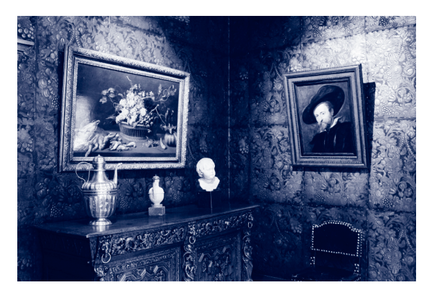
Objects on display in the house of the Baroque painter Peter Paul Rubens in Antwerp

A number of shelters already exist in Belgium to protect works of art (notably within the Royal Museums of Fine Arts of Belgium, the Royal Museums of Art and History, the Mariemont Royal Museum, etc.).<sup>89</sup>