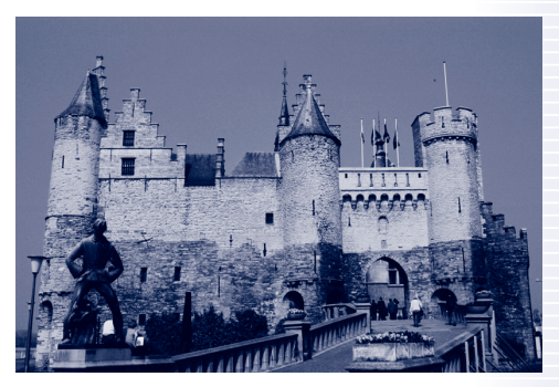
"Het Steen", Antwerp.